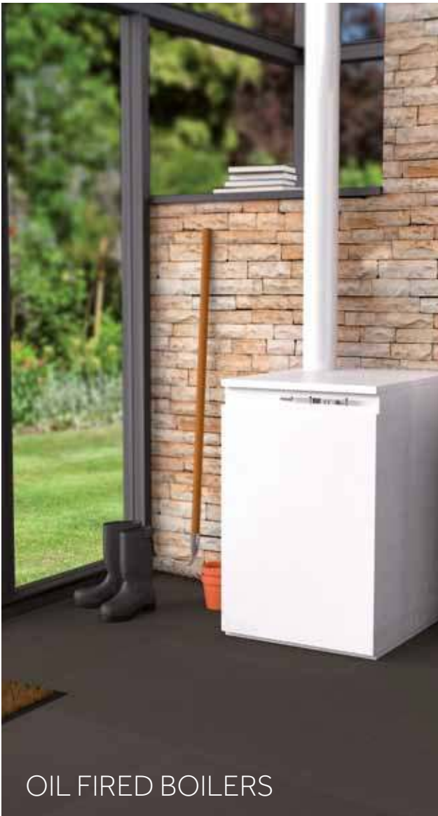
OIL FIRED BOILERS