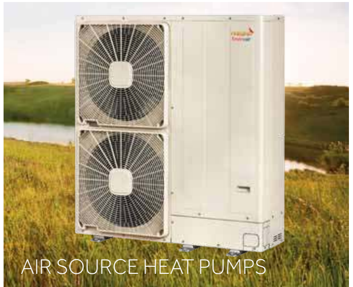
AIR SOURCE HEAT PUMPS