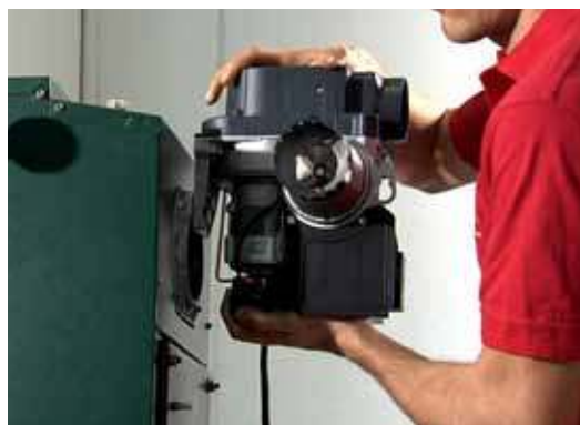
Dedicated Servicing Position.