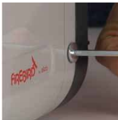
Fast & Easy to Install.